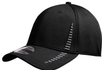
Neutral Black C / 431C