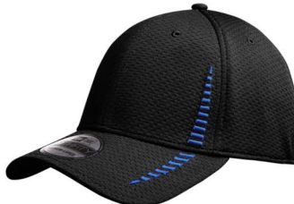
Neutral Black C / 2728C