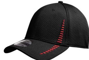
Neutral Black C / Between 200C & 201C