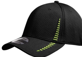
Neutral Black C / Between 374C & 375C