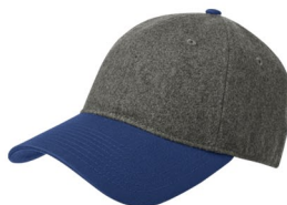
No PMS / 288C