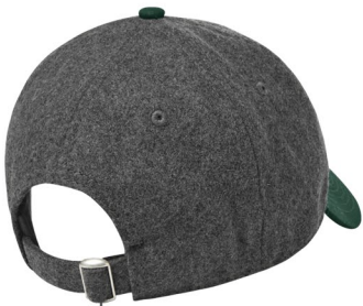
Adjustable D-clip closure