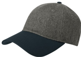
No PMS / 282C