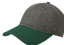
No PMS / 560C