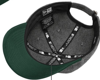
NEW ERA® tapping on inside seams