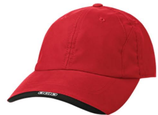
186C / Black 6C