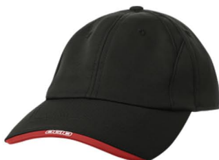
Black 6C / 1797C