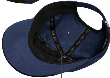
OGIO® tapping on inside seams