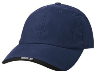
2768C / Black 6C