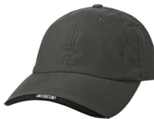
432C / Black 6C