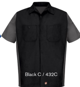
BLACK / CHARCOAL