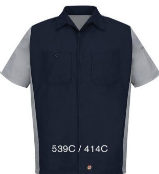
NAVY / GREY