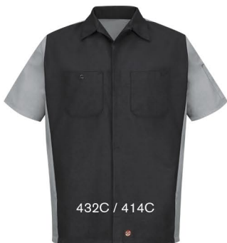
CHARCOAL / GREY

Textile fabric colours are subject to dye lot variation and will not be exact match to print pantone reference