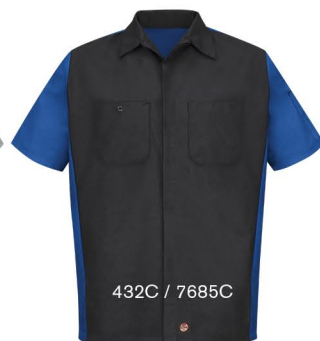
CHARCOAL / ROYAL BLUE