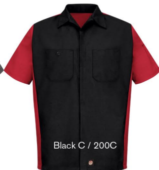
BLACK / RED